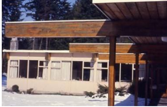
Figure 11. Glulam with top flashing but still stained on sides