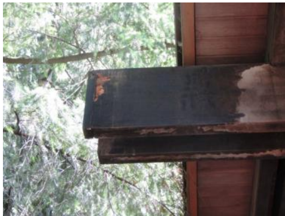
Figure 3. Rot in end of glulam beam with a wood end cap (Diagonal cut let in water and end-cap stopped end grain from drying out.)