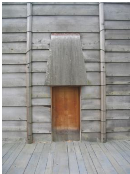
Figure 21. Weathered patina on naturally durable wood

Durability by Treatment: There may be situations where some degree of exposure to water and UV is unavoidable or desirable for a certain look. Where naturally durable woods may not provide adequate performance or will not be cost effective, then less durable woods will need to be preservative treated to provide the desired service life. To minimize costs and any potential for adverse environmental impact during or at the end of the service life, the choice of preservative and degree of treatment should be matched to the anticipated decay and termite hazard. This will be affected by the: