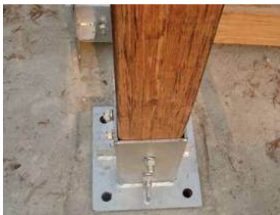
Figure 17. Metal boot around the base of a column is like putting wood in a bucket of water