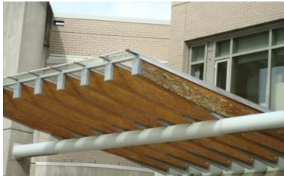
Figure 7. Inadequate overhang leading to coating failure on glulam side