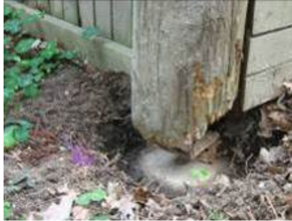
Figure 13. Rot in column base where soil level has risen.