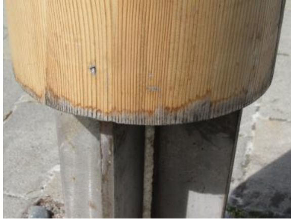
Figure 18. Column base without drip edge showing black-stain fungus and coating failure

Drying out after wetting will reduce the time the wood spends at suitable moisture contents for decay and growth of black-stain fungi. Many of the above measures for drainage will also encourage drying, as will any design features that promote airflow over and through the structure. End-grain dries more rapidly than side grain and is best left uncovered unless fully-exposed to rain. Bear in mind that exterior components have no heat from the building to assist in drying. Maximizing sun exposure will certainly aid drying but will adversely affect coating performance. Shady locations reduce drying and may encourage the growth of moss and algae which retain water after rain events (Figures 3, 16). Some climates are clearly more conducive to drying than others. Drying is difficult to do well in most climates. It is better to focus on keeping the wood from getting wet in the first place.