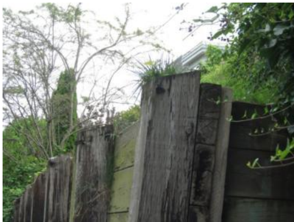
Figure 10. Rot (growing grass) in top of creosoted timber column cut at an angle

Top-flashing (Figure 11) and end-flashing (Figure 12) are commonly used to protect beams projecting to or beyond the roof line. However, top flashing has extremely limited efficacy and poorly designed end caps can trap water and promote decay (Figure 3). Any defects in jointing or fastening metal flashing can create cupping and/or permit water penetration. Moisture can move by capillarity between the flashing and the wood if it is not gapped away from the wood at the top, sides and ends. Water simply flows down the side of the beam if the flashing does not have drip edges (Figure 11). Downward facing cracks can occur in the unprotected sides of beams permitting uptake of water and ingress of decay fungi. If, despite advice to the contrary above, the native west coast style of beams projecting beyond the roof line is desired, it can make sense to make the beam ends detachable and replaceable, with concealed connections. They can also be made from naturally durable or preservative treated wood. This will prevent decay in the exterior part of the beam progressing close to or through the building enclosure necessitating much higher repair costs.