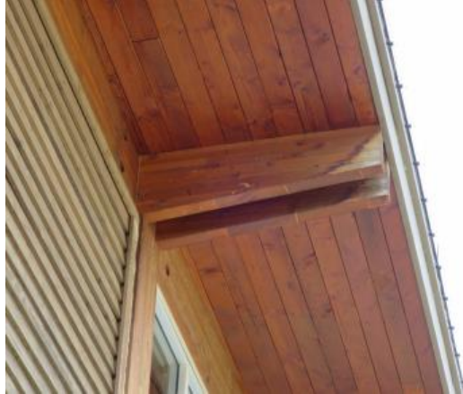
Figure 6. Inadequate overhang to protect beam from wind-driven rain leading to staining and coating failure on glulam ends