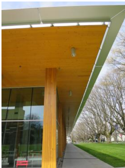
Figure 4. Exterior glulam and soffit on modern post and beam building under overhang – well protected.