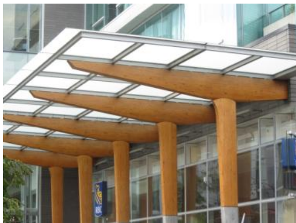
Figure 5. Exterior glulam on modern steel and concrete building protected by glass canopy, after 5 years without refinishing – well protected.

Overhangs may take the form of a traditional pitched roof in recreational properties (Figure 4), however, in modern mass timber construction overhangs are typically made from glass to maintain the visual impact of the mass timber (Figure 5). Most importantly, designers need to consider wind-driven rain when determining the width of overhang. Too often overhangs are just too small to provide adequate protection to ends (Figure 6) and sides (Figure 7). In areas with high winds and/or small raindrop sizes, wind-driven rain can move horizontally or even upwards. As a general guide, wood components should not be installed lower and closer to the edge of an overhang than an imaginary line drawn at 60 degrees from vertical, as shown in Figure 8, unless they are pressure preservative treated or made of naturally durable species. Ends of beams should be cut at an angle of 45° or more such that the end-grain effectively faces the ground (Figures 5, 9). Take a look at newly installed beams with square ends below an inadequate overhang on a sunny day and you will see a diagonal shadow line. Take a look at older beams in the same situation and you will see a diagonal weathering line. Take a tip from nature and remove the part that will get weathered due to exposure to wind-driven rain (Figure 6). Cutting the other way so that the end-grain effectively faces up (or slanting the top of columns Figure 10) does not promote run-off and exposes even more end-grain to absorption of rain.