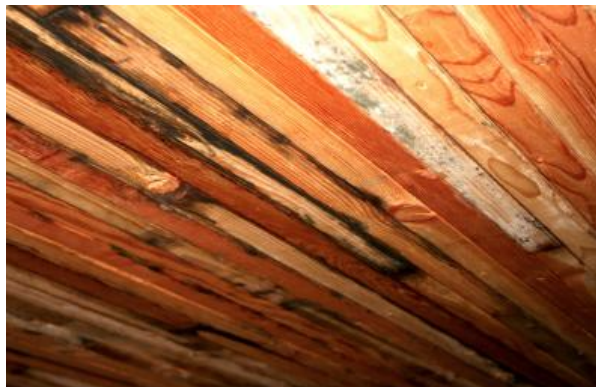
Figure 15. Moisture trapped in nail-laminated timber deck and causing damage

rapid a path as possible to the ground. End caps should be gapped away from the wood to permit drainage and drying.