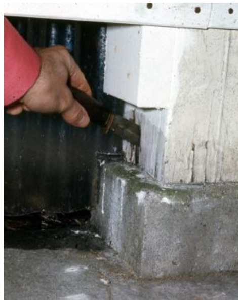
Figure 14. Rot in column base in direct contact with concrete.

Drainage means avoiding water traps and encouraging water to run off, or drain between, components. Avoid creating anything like a bowl effect that will hold water. Eliminate strictly horizontal surfaces and slope surfaces away from the centre of the structure. Avoid using parallel beams appressed against each other creating a capillary to hold water (Figure 15) unless the beams are preservative treated. Crossing beams can create a similar but lesser capillary space (Figure 16). Spacing components to eliminate capillaries and encourage draining needs to be done with a view to ensuring effective load transfer between those components. Ensure adequate gaps between flashing, glass or other materials and the wood surface to prevent capillarity. Avoid using connectors that encase the wood components: metal boots to hold the base of wood columns are the worst example (Figure 17). If part of the structure will tend to collect water, make sure it does not shed that water onto another part of the structure. Create drip grooves on the underside of horizontals and the bottom of verticals to prevent water from flowing back underneath wicking up the end grain and causing growth of black-stain fungi and coating failure (Figure 18). Think like a raindrop and make sure it has as