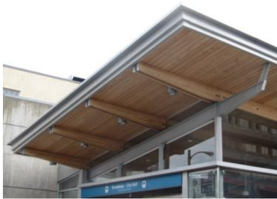
Figure 12. Glulam with end flashing and wood soffit – well protected

Also keep the base of the wood components well above ground to avoid splash-back and potential for direct soil contact as ground level inevitably rises (Figure 13). Never put wood components in direct contact with concrete less than 150mm above finished soil level because water wicks up concrete (Figure 14). Always slope concrete away from wood components.