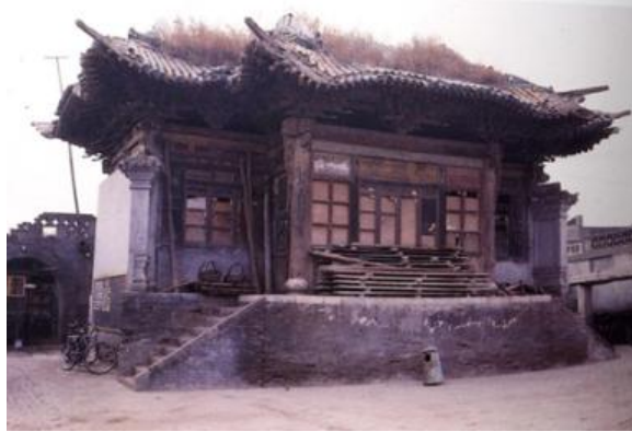
Figure 2. Ancient Chinese temple with exposed timbers