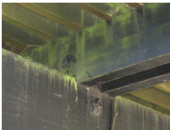
Figure 16. Crossing beams trapping water by capillarity showing up as algal stain