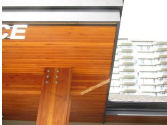
Figure 9. End of beams cut at an angle and wood soffit – well protected