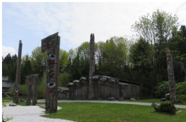
Figure 1. Pacific coast first nations' longhouses with projecting cedar timbers (photo taken at the BC Museum of Anthropology at the University of British Columbia in Vancouver)