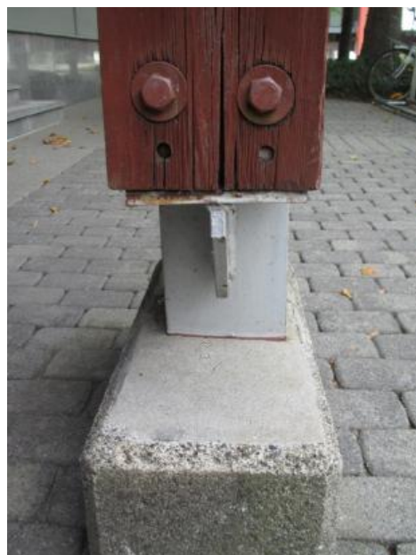
Figure 22. Borate rod placement between end grain and bolt holes

The risk of degradation can be reduced by taking another look at the structure once it is built and providing additional in-situ treatment where necessary before deterioration begins.