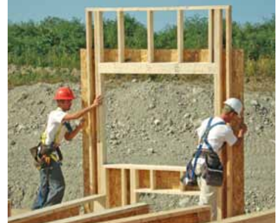
Microtel Inn & Suites, Parry Sound, ON

What's best for society in the context of constructing low-rise school buildings? For a strong society, people need to be engaged – both at work and at home. When local industries are not validated, the result is a workforce that migrates out of our communities thereby eroding the very fabric needed for a strong society. The Ontario forest industry supports more than 200,000 direct and indirect jobs in over 260 Ontario communities.<sup>9</sup> Of these communities, 40 depend primarily on the forest sector for their survival and another 63 would be severely affected should it disappear. The use of local industries in the construction of school buildings not only keeps the Ontario economy strong, it employs its citizens and helps to create the strong communities that are needed to sustain Ontario's society.