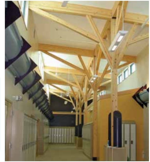
École secondaire de la Vérendrye

21 CIBP was a national financial incentive program in place from April 1998 to March 2007.