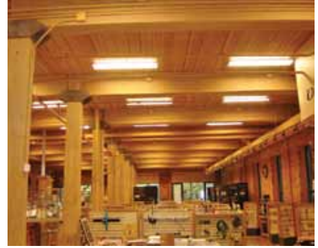
Lee Valley Tools, Toronto, ON Turn of the century wood building located on King Street in Toronto.

Lower operating costs afforded by wood buildings are of obvious interest to building owners. Owners also want to be assured that their building will last and fulfill its intended purpose for years to come. When a wood building is properly designed and detailed, and is appropriately maintained, its life-span can be limited only by the changes in use that it may be subjected to over its lifetime. The durability of wood buildings is evidenced by the myriad of centuries-old buildings found around the globe. There is no need to look further than North America, however, where wood buildings, whether residential or nonresidential, have longer life-spans than buildings built using any other construction system. The ease with which a wood building can be adapted for changing needs is in large part the reason for this longevity.