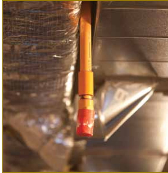
PROTECTED SPRINKLER SUSPENDED FROM CEILING

There are also specific sprinkler-related issues to be considered in contemplating either the early installation of a permanent sprinkler system, if one is to be