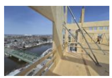
From the eighth floor, the Saint-Charles River and the Pointe-aux-Lièvres Bridge make for a beautiful northeastern panorama.

"Why pour so much effort into developing these solid wood panels only to camouflage them in the end? Because of the 'sandy soil' found near the river," explained George Blouin. "If we'd built using concrete, we couldn't have had more than six floors." The promoter wanted a tall and light building that wouldn't cause the ground to move or settle. Wood was the logical choice for this tower destined to become a landmark of this district straddling Limoilou and Saint-Roch.