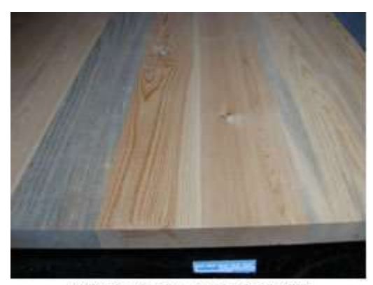
Bluestained wood products