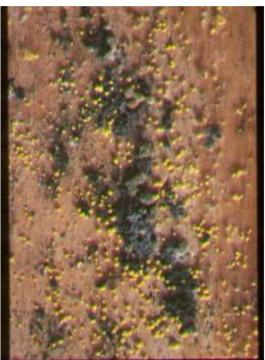
Decayed (left) and moldy (right) wood