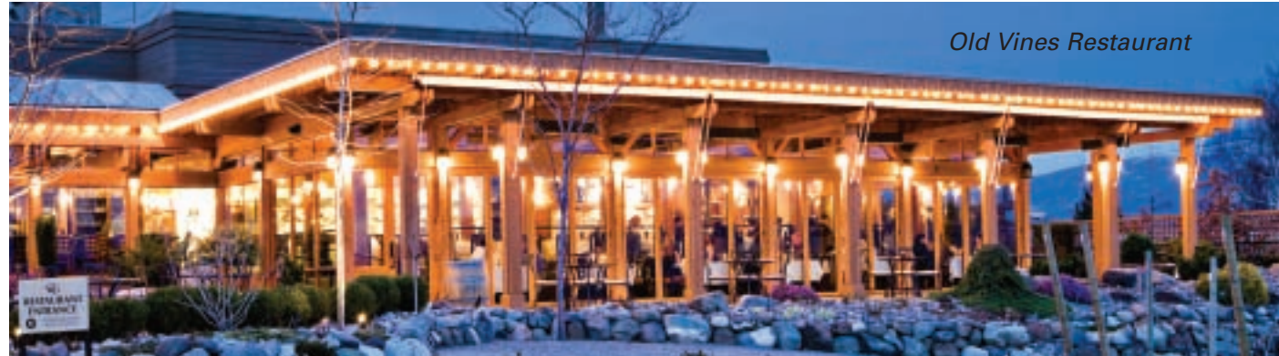
Old Vines Restaurant