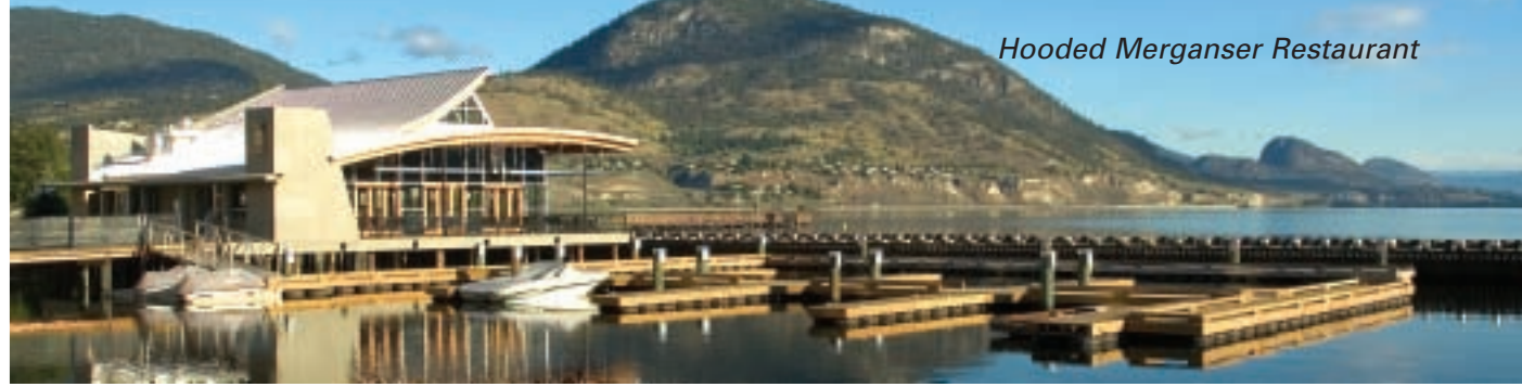
Hooded Merganser Restaurant