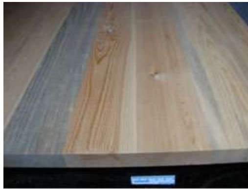
Bluestained wood products